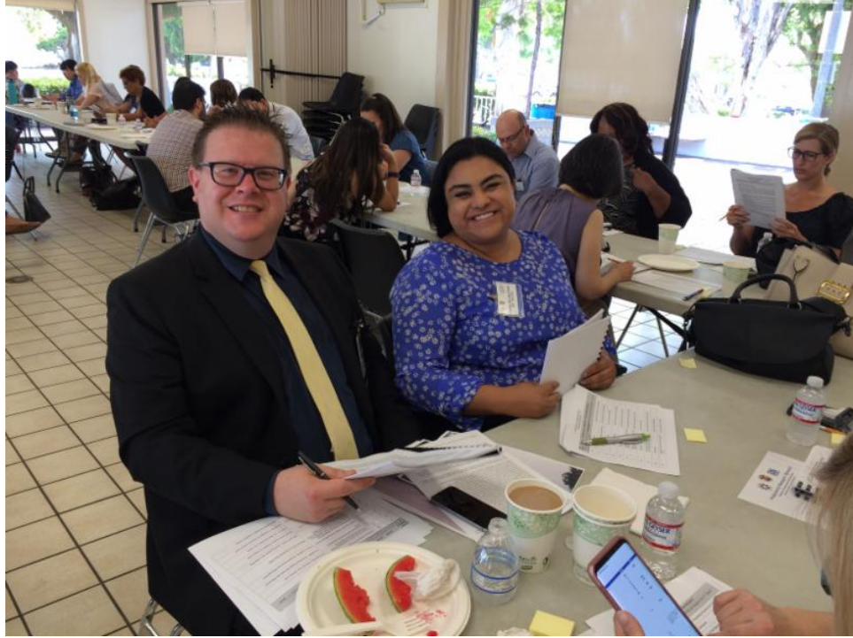
Productivity Managers Reading Proposals