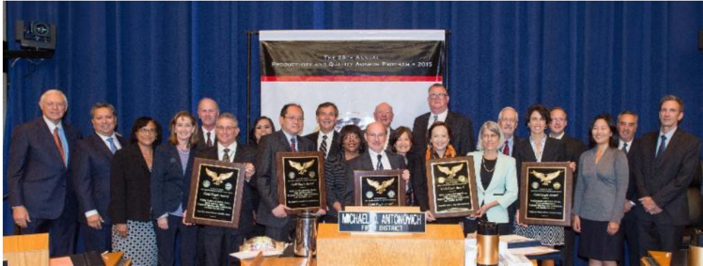
2015 Gold Eagle Award Recipients (Public Health, Public Works, Parks & Recreation, Arts Commission, Regional Planning and Internal Services)