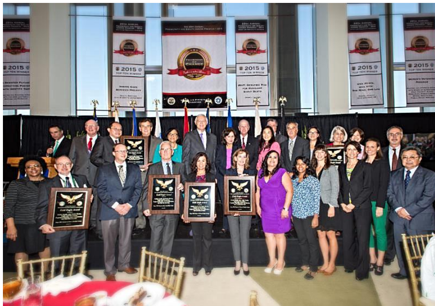
2015 Golden Eagle Award Recipients Public Health with Public Works, Parks and Recreation,

Will your department be a Top Ten recipient? Who will receive the coveted "Golden Eagle" Award? These questions and many more will be answered at the PQA luncheon on October 19, 2016.